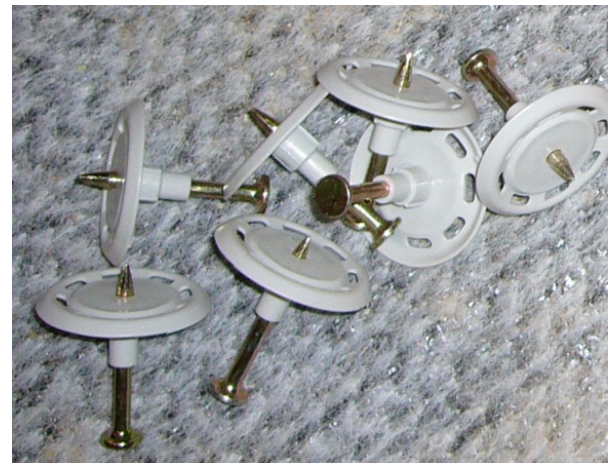
Soft Washer Fixings